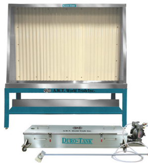
Kleen-view Washout Sink & Duro-tank Recirculating System