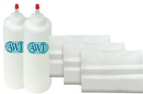
Spreaders/Scrapers Applicator Bottles

Take a look at some of our other AWT Products!