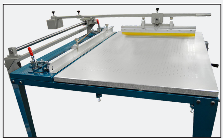
Optional Print Side Arm feature reduces operator fatigue and ensures consistent print stroke and image quality.