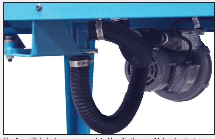
The Accu-Glide features a heavy-duty Max-Air Vacuum Motor standard.