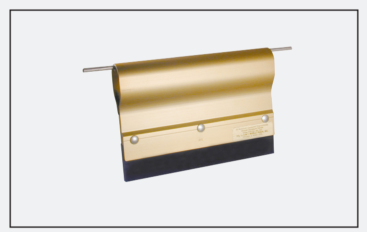
An all-aluminum, ergonomically-shaped squeegee holder with Poly-Supreme ^{\text{TM}} Plus squeegee blade is included with the Accu-Glide.